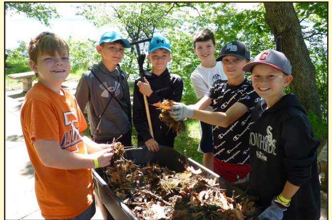
Southfield Church youth cleaned the Tea House and tidied Memory Lane

We hope you enjoy the enclosed photographs and stories of Christ's light shining in people's hearts at Green Lake. This year has been an amazing year of growth and blessings and we are grateful for your continued assistance and support. We invite you to pray and ask Christ to shine His light into the lives He wishes to transform, bless, and care for at Green Lake in 2023. We also invite you to give financially or through volunteer service to help us enable more people to experience a closer walk with God on these sacred grounds in 2023 and decades beyond.